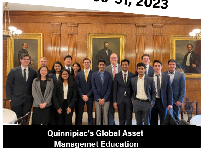
Quinnipiac's Global Asset Management Education