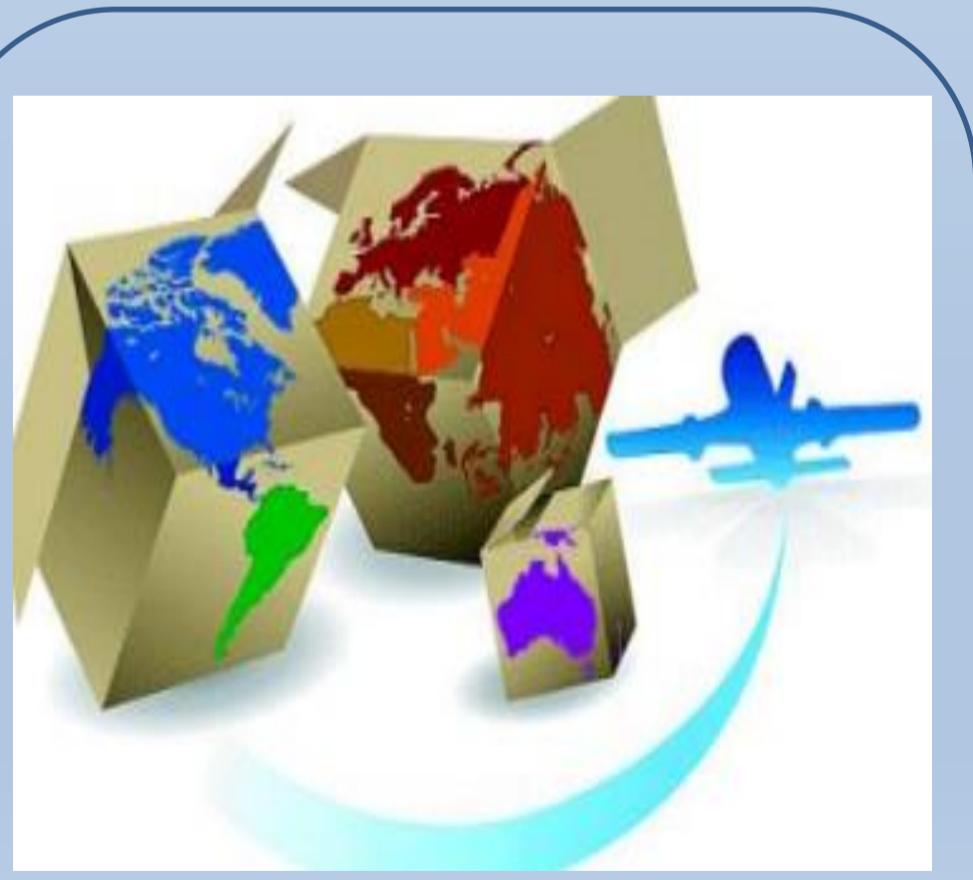
Cost Savings from Freight Shipments